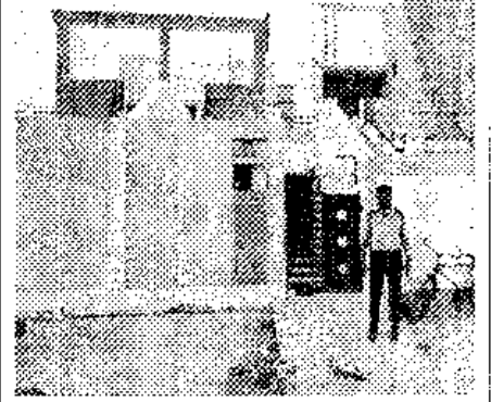
PHOTO OF THE PROPERTY